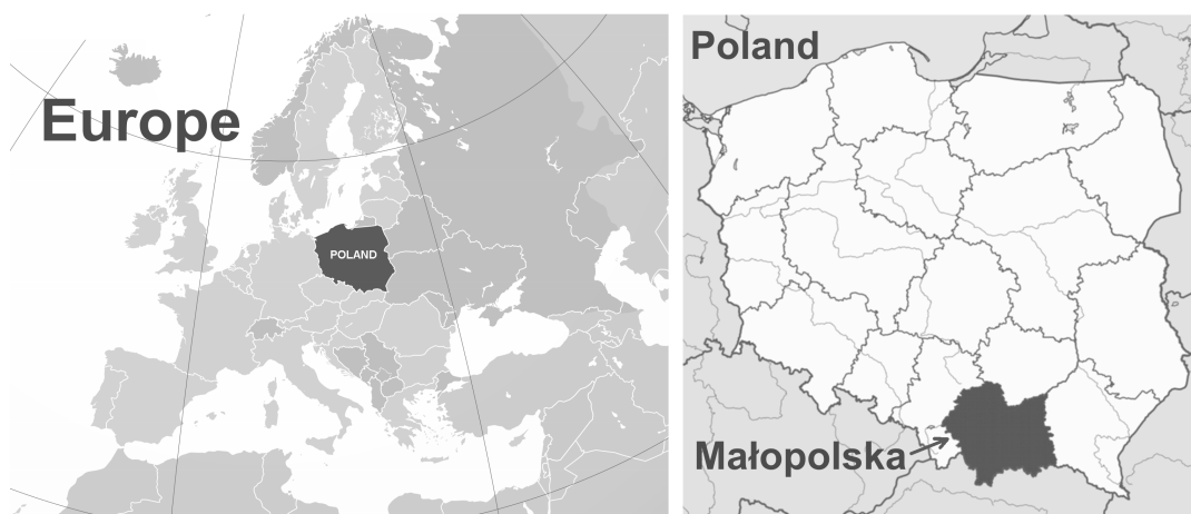
Fig. 1. Malopolska Province in Europe and in Poland

analysis. The total number of plots in this case is around 4.5 million. Figure 1 shows the location of the study area.