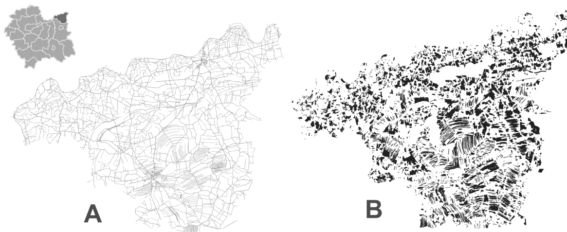
Fig. 2. Example of isolated set of plots which identifies transportation network and the resulting set of plots with no access to the network